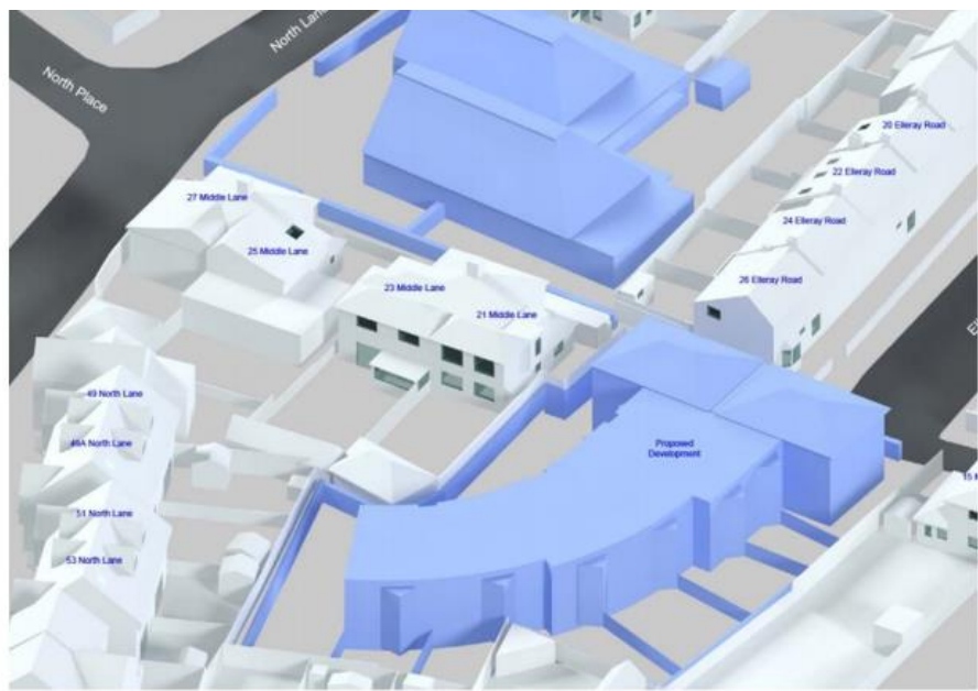
Image from Daylight and Sunlight Report (Neighbouring Properties), Appendix I