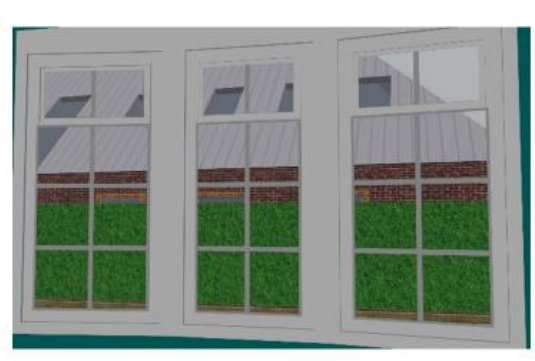
View from Building of Townscape Merit in Middle Lane showing overbearing hall and light blocked by Hall development at 8m

The above image from planning documents shows the proposed developments are overbearing and an overdevelopment of existing sites. This leads to privacy, light and noise issues. As part of our submission, and to demonstrate these issues, we would like the LPA to view the video produced by residents showing a tour of 3-D Model of the proposal at; <a href="https://youtu.be/jzaxUmHvu8c">https://youtu.be/jzaxUmHvu8c</a>