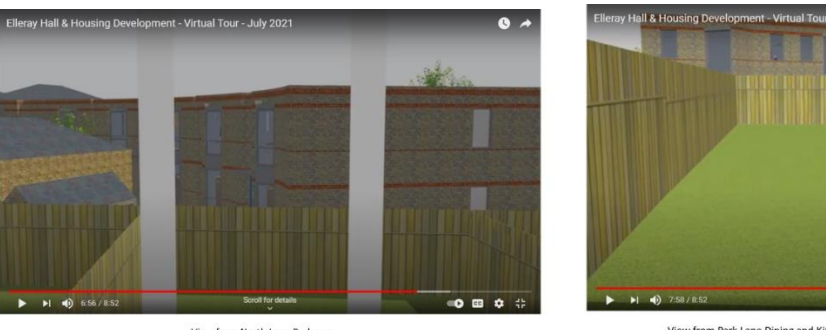
Ellersy Hall & Housing Development—Virtual Tour. July 2021

For the existing neighbours of the Elleray Hall site the proposed flats are overbearing and create privacy issues as shown in the following images;